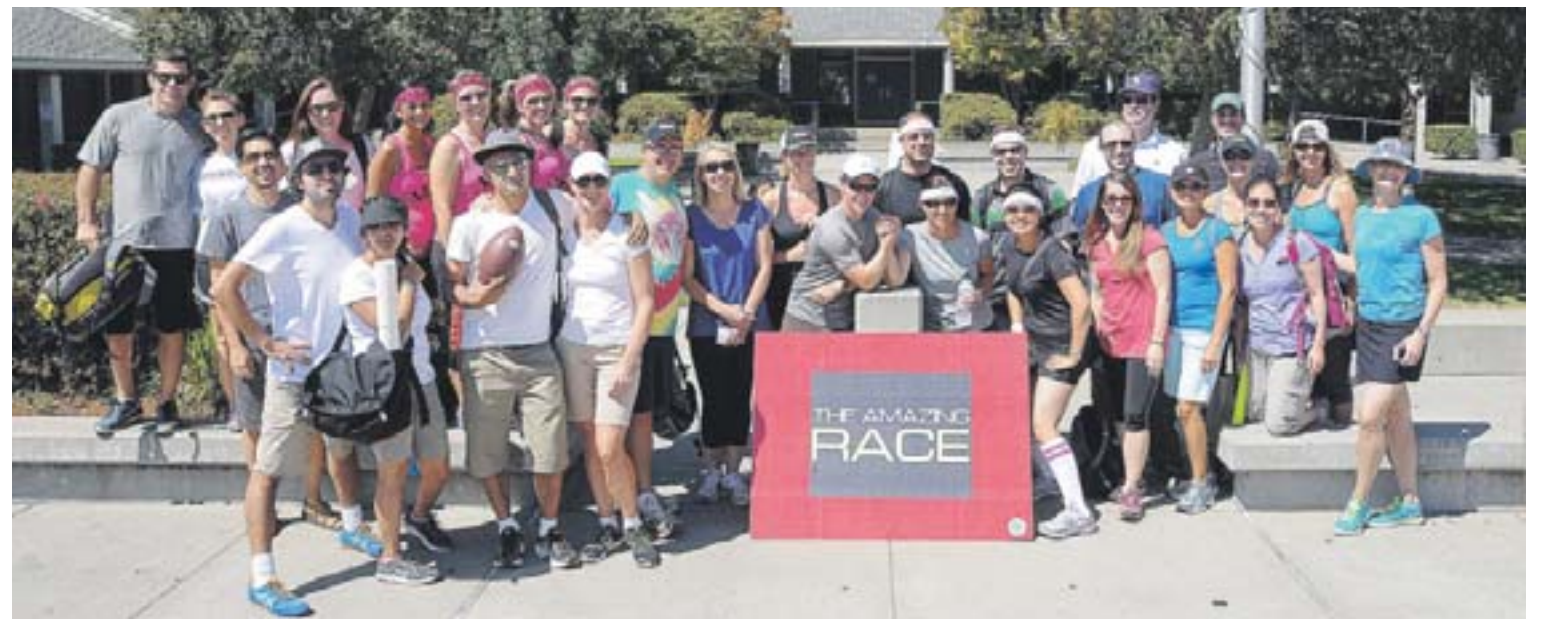
Contestants ready for adventure on the first LPIE Amazing Race.